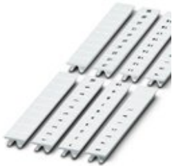
Zack marker strip, 10-section, vertically labeled with the consecutive numbers: 1 ... 10, white, width: 5 mm

Please be informed that the data shown in this PDF Document is generated from our Online Catalog. Please find the complete data in the user's documentation. Our General Terms of Use for Downloads are valid ( http://phoenixcontact.com/download )